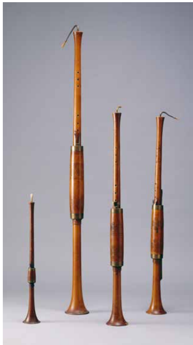
Pommer family

ments can thus be used until today, it is not surprising that around 1890 only the wind instruments – useless for the normal practise – were sold from the St. Wenzel Church; the buyer was the Prussian Ministry of Culture, which acquired them at the price of 4.000 German marks for the former collection of ancient musical instruments at the Royal College of Music, the today's Musical Instrument Museum of the State Institute for Music Research, Prussian Cultural Heritage. The intellectual basis for this offered the historicism, in particular the growing interest for old music in the 19 th century, which finally led to renewed appreciation of ancient instruments.