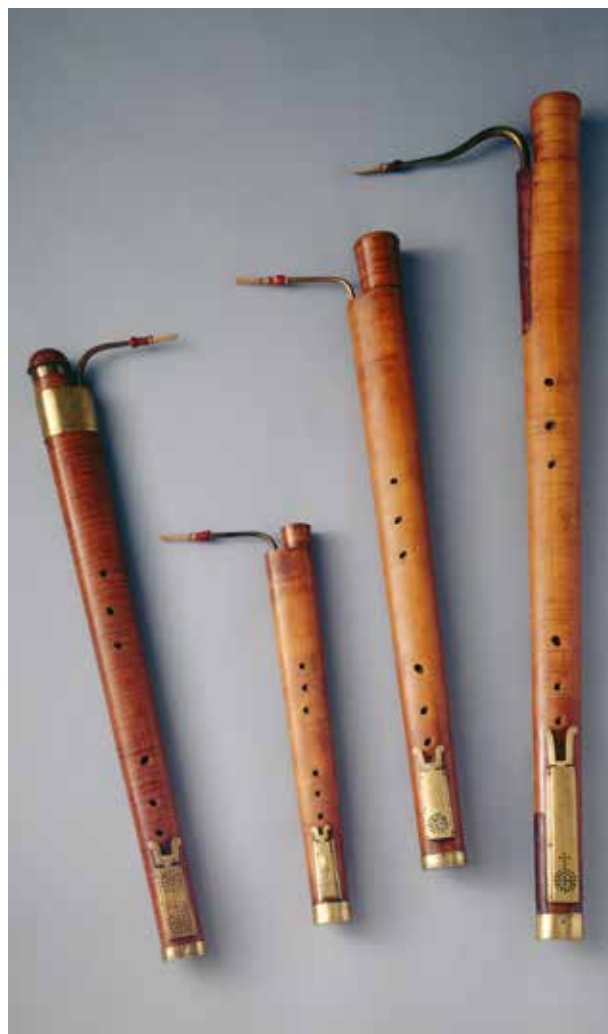
Dulzians family

»Pommer« means according to Praetorius an instrument family with double reed; the reed is conical, a windcap is usually omitted. The high instruments of this family were also referred to as »shawms«, according to the lists of the St. Wenzel Church dated about 1720 and 1728. Here they are mentioned with the addition of »German«, probably to differentiate them from the French oboe, which was modern in those days and came from the shawn. The pommers originally sounded like the schryari. Praetorius compares the sound of the shawm with the cackling of a goose. This sound was among other things due to the fact that the wind player vibrated the reed more or less freely in the mouth cavity, thus using it to a certain extent as a windcap. However, the absence of a real windcap meant that a change of the sound was already possible through the playing technique; the lips could hold the reed. Actually the oboe has been developing from the discant pommer (the shawm) relatively continuously. The pommer was often played with pirouette, i. e. with a wooden top part which forms a small disc above. It served as support for the lips so that the player could often use the windcap. The ending of the lip-ring was one of the steps on the way to the oboe: Due to holding